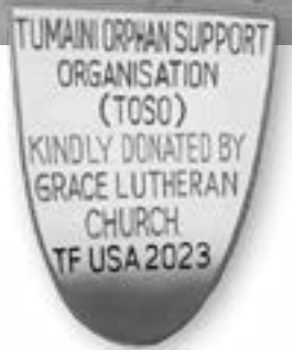
Clockwise from left: old house, new home, plaque of recognition.