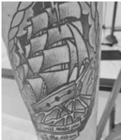
Figure 1 I will Praise You in the Storm