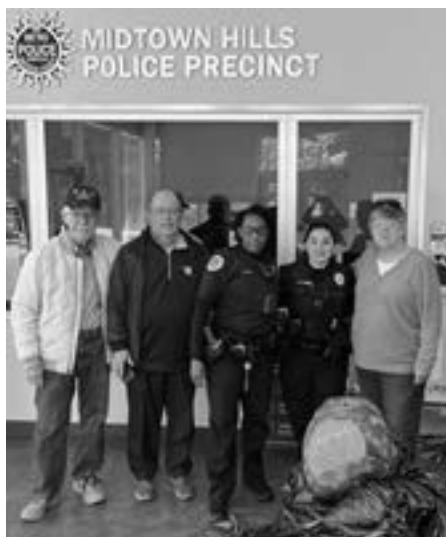
Above: A delivery to the Midtown Hills Police Precinct. Right: the 400 stuffed animals collected!

The Women in Mission group at Our Savior Lutheran Church (OSLC), Nashville, have developed a bond with the local emergency responders. Every month, home baked cookies are delivered to the Midtown Hills Police Precinct of Nashville, and Fire Station 27. Throughout the month of March, this group, with the help of the congregation and academy, collected over 400 stuffed animals that were delivered to the Midtown Hills Police Department. The stuffed animals are kept in the trunks of patrol cars to provide comfort to children in crisis situations.