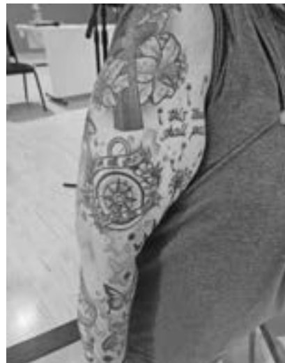
Figure 3 This Too Shall Pass