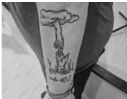
Figure 2 Psalm 40:2

"No matter what comes my way I will always remember that God is sovereign, and He is in control. It is easy to praise God when things are going your way but in the middle of a disaster, it is much more difficult."