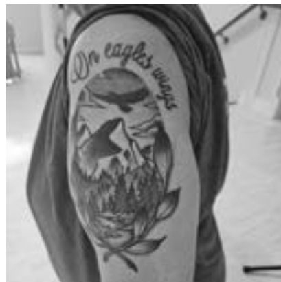
Figure 4 On Eagles Wings

"No matter what trial I am facing or going through, I know that it is just temporary, and God will see me safely through it. Not all who wander are lost —God has set me on the right path. Sometimes I wander away from that path, but I know what I must do to get back on track."